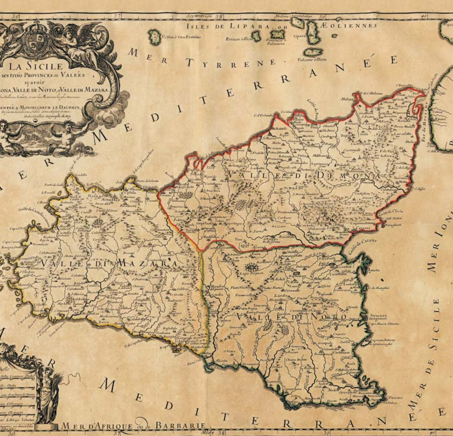
in the fifteenth Century Sicily was already the Queen of the Mediterranean Sea